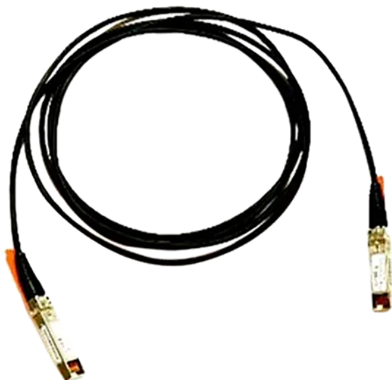
Figure 4. Cisco direct-attach twinax copper cable assembly with SFP+ connectors

Cisco SFP+ Copper Twinax (Figure 4) direct-attach cables are suitable for very short distances and offer a cost-effective way to connect within racks and across adjacent racks. Cisco offers passive Twinax cables in lengths of 1, 1.5, 2, 2.5, 3, 4 and 5 meters, and active Twinax cables in lengths of 7 and 10 meters.