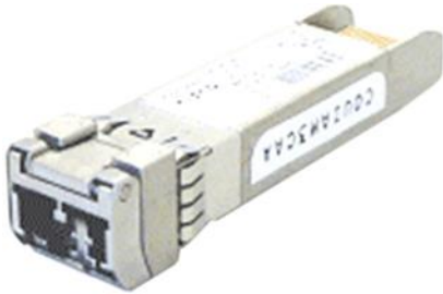
Figure 1. Cisco 10GBASE SFP+ modules

The Cisco® 10GBASE SFP+ modules (Figure 1) give you a wide variety of 10 Gigabit Ethernet connectivity options for data center, enterprise wiring closet, and service provider transport applications.