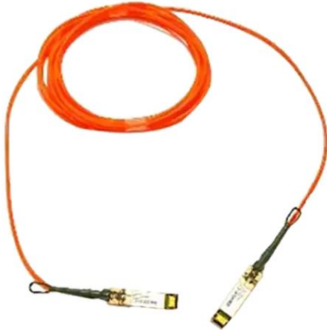
Figure 5. Cisco direct-attach active optical cables with SFP+ connectors

Cisco SFP+ Active Optical Cables (Figure 5) are direct-attach fiber assemblies with SFP+ connectors. They are suitable for very short distances and offer a cost-effective way to connect within racks and across adjacent racks. Cisco offers Active Optical Cables in lengths of 1, 2, 3, 5, 7, and 10 meters.