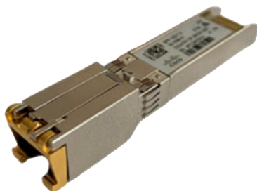
Figure 2. Cisco SFP+ 10GBASE-T module with RJ-45 connector

The Cisco 10GBASE-T module (Figure 2) offers connectivity options at the following data rates: 100M/1G/10Gbps. It has the SFP+ form factor and an RJ-45 interface so that CAT5e/CAT6A/CAT7 cables can be used to connect to end points with embedded 10GBASE-T ports. They are suitable for distances up to 30 meters and offers a cost-effective way to connect within racks and across adjacent racks.